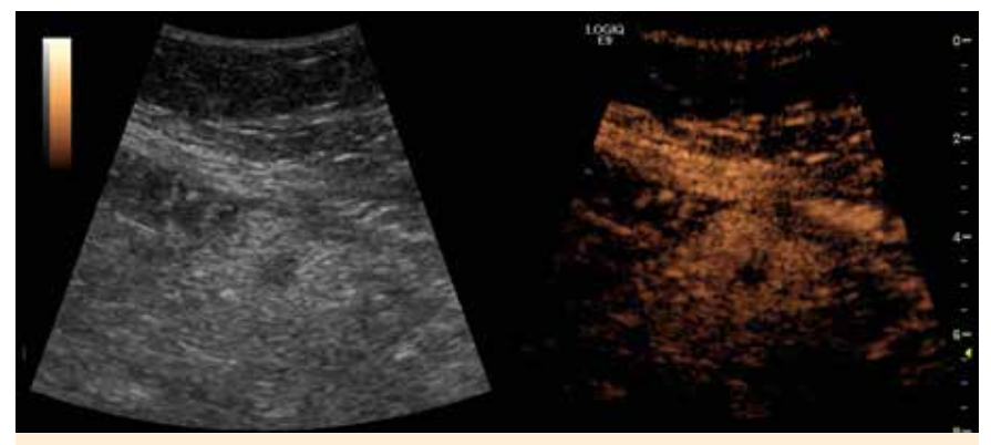
Fig. 3 Contrast enhanced ultrasound (CEUS) clarifies that the fibrofatty mass / 'mesenteric cap' comprises a hyperperfused peridiverticular mesenteric inflammatory reaction. Acute diverticulitis CDD type 1a (transverse section through the inflamed diverticulum). Enhancement of Sonovue<sup>®</sup> -bubbles 1.33 min p.i.

stranding but detects inflamed diverticula in acute diverticulitis in a minority of 30% only [24] US is superior to CT in detecting traces of gas next to a diverticulum ( •Fig. 4 ). Empirically, at CT the differentiation of such small gas bubbles inside vs outside a diverticulum can easily be misleading whereas gas covering an abscess is more likely masked at US (but rare in small abscesses ( •Fig. 5a ) and technically avoidable in larger ones ( •Fig. 5b )).