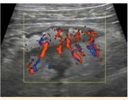
Fig. 7 Uprightening of the arterioles at their penetration site through the colonic wall (a consequence of muscular hypertrophy and elastosis in diverticular disease). See also Fig. 4b

perforation are present, but also whether the a.m. morphological criteria of diverticulitis are present, or segmental colonic inflammation involves 'innocent' diverticula only.