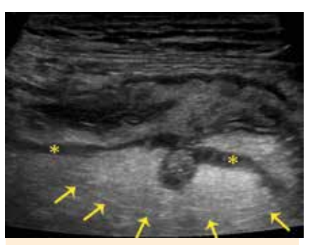
Fig. 6 Acute diverticulitis CDD type 1a. Regard the muscular hypertrophy (*) and increased wall thickness. This figure has been obtained during his night duty by an assistant with 2 years experience in medicine (S. Ntovas). The inflamed diverticulum is empty (dome-sign) and surrounded by the inflammatory mesenteric reaction (arrows).

As diverticulitis starts in a single diverticulum only, this is usually the site of maximum pain under compression (and the classical point of interest to put the transducer on), but inflammation can secondarily spread in longitudinal direction. Beginning in the outpouched mucosa inflammation of the diverticulum is invisible at colonoscopy unless inflammation spreads back from peridiverticulitis to the mucosa or unless a tear in the diverticular neck due to the passage of a koprolith has triggered diverticulitis [29]. Hence, the desired information from cross sectional imaging is not only whether abscess or