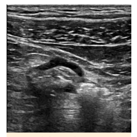
Fig.1 Muscular hypertrophy as a prerequisite for diverticulosis (left colon) is well visible at US. Impressive hypertrophy / elastosis of the muscular layer in diverticulosis (type 0).

Accordingly (in theory), any acute diverticulitis encompasses microperforation. The differentiation between complicated and uncomplicated diverticulitis refers to the presence / absence of a perforation detected by air, fistula or abscess at the respective imaging method or at operation. Not only from US-experience but also because CT almost exclusively relies on broadening of the sigmoid wall and pericolic